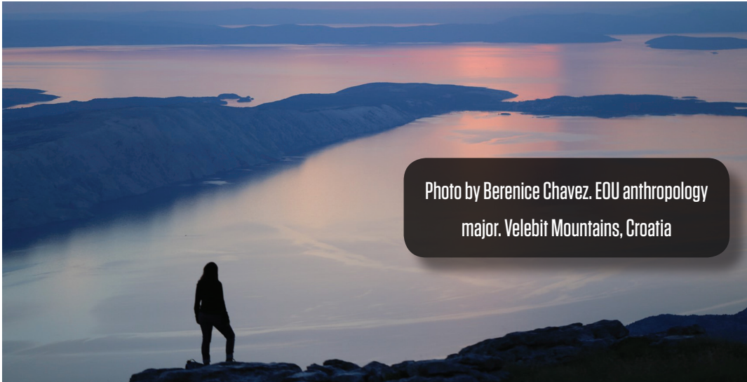
Photo by Berenice Chavez, EOU anthropology major. Velebit Mountains, Croatia