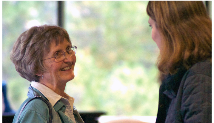
Scholarship donors have the opportunity to meet with their student recipients each year at Tea & Trumpets.